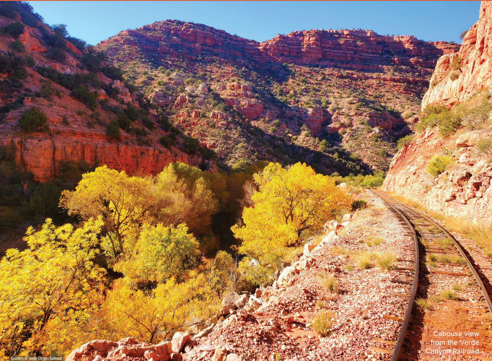
Caboose view from the Verde Canyon Railroad