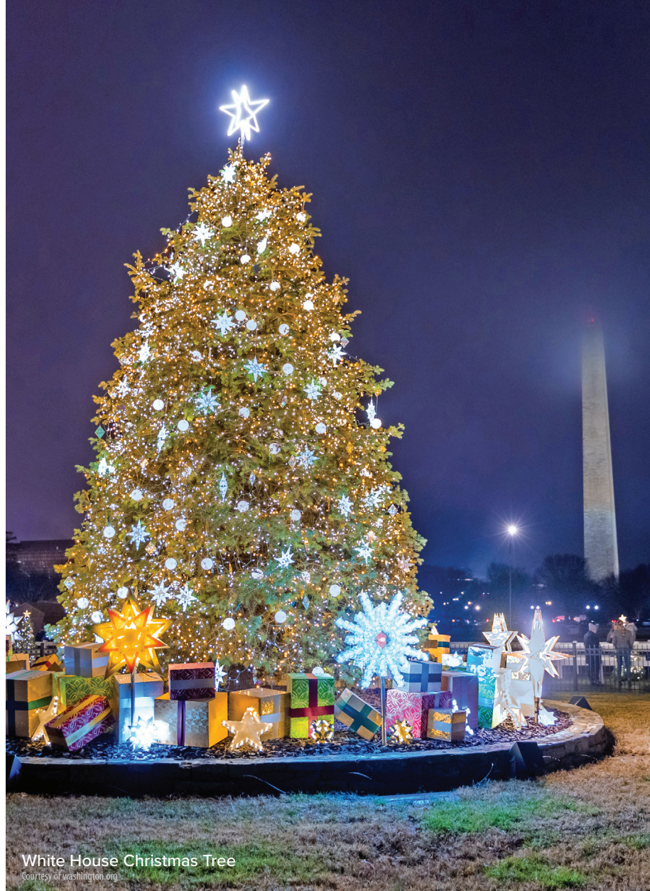
White House Christmas Tree

DAY 1: ARRIVE IN WASHINGTON, D.C. Our first stop will be the U.S. National Botanic Gardens for their “Seasons Greenings” Holiday Exhibits. You’ll find the Conservatory full of poinsettias, holiday decor, and D.C. landmarks made from plants. In the outdoor gardens, you will find festive lights and decor throughout, plus a model train show. After your visit to the Botanic Garden, you will check into the Gaylord National Resort for a four (4) night stay. Enjoy free time to explore the dazzling holiday lights both at the National Harbor & within the Gaylord’s expansive atrium including a Fountain Show and indoor snowfall! Cap off your day with a ride on The Capital Wheel at National Harbor, offering stunning bird’s-eye views of D.C. glowing with holiday lights. Dinner is on your own this evening.