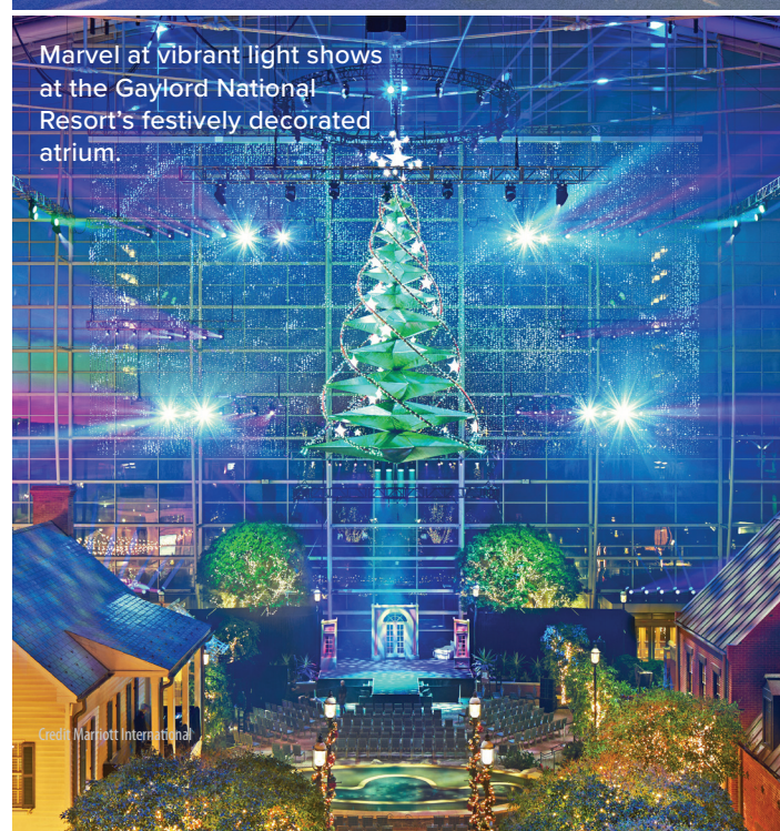
Marvel at vibrant light shows at the Gaylord National Resort's festively decorated atrium.

DAY 5: JOURNEY HOME Following breakfast and check-out, you will be transferred to the airport for your return flight home, with fond memories of Christmas in the Capital! 🚗 B