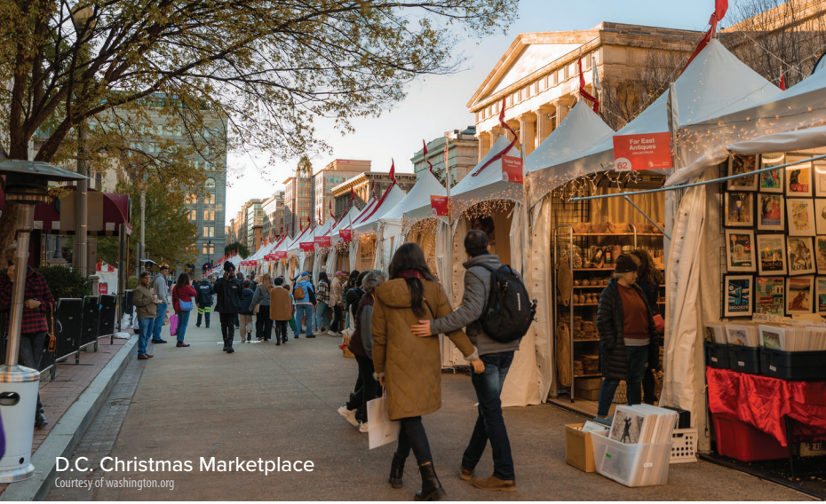
D.C. Christmas Marketplace