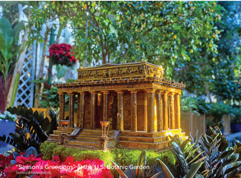
"Season's Greenings" at the U.S. Botanic Garden